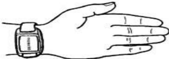
This special VNS magnet is worn on the wrist.

A magnet is used to activate the VNS when a child is having an aura or a seizure.