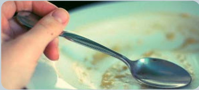
Food Planning Associations